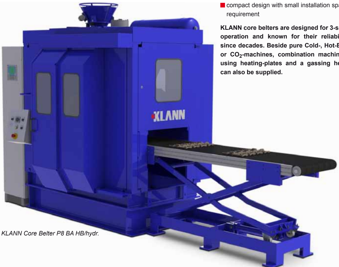
KLANN Core Belter P8 BA HB/hydr.

KLANN core belters are designed for 3-shift operation and known for their reliability since decades. Beside pure Cold-, Hot-Box or CO 2 -machines, combination machines, using heating-plates and a gassing head can also be supplied.