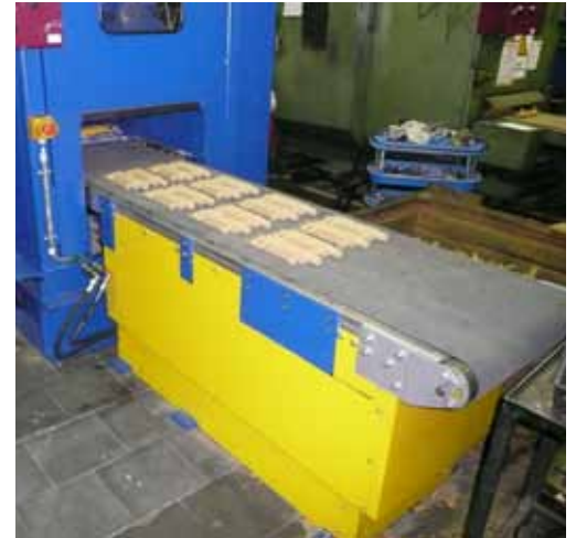
Core discharge on belt conveyor