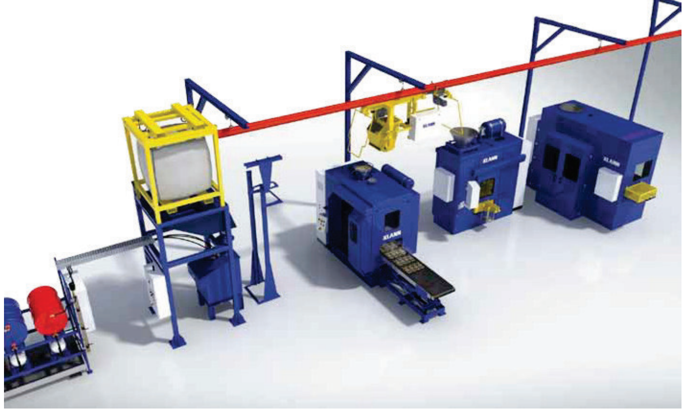
possible arrangement of a core sand processing and distribution system